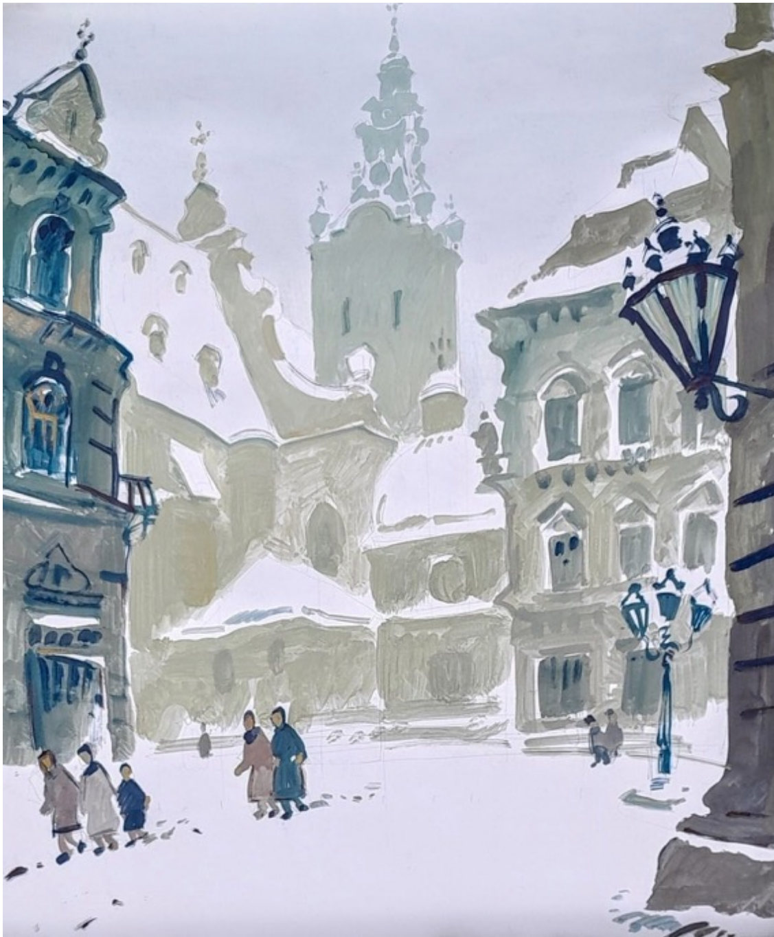
Artist U. Khimych

We are taking monetary donations for humanitarian aid to Ukraine. Please show your support for Ukraine and its children by dropping off your contributions in the office.